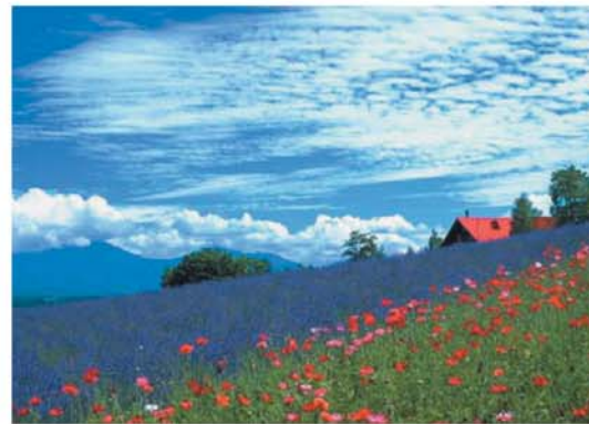
Town of the Live Volcano Mt. Tokachidake

Biei is divided into two visually stunning areas, the Panorama Roads and the Patchwork Area. Shirogane Onsen Hot Spring Village is also located in Biei.