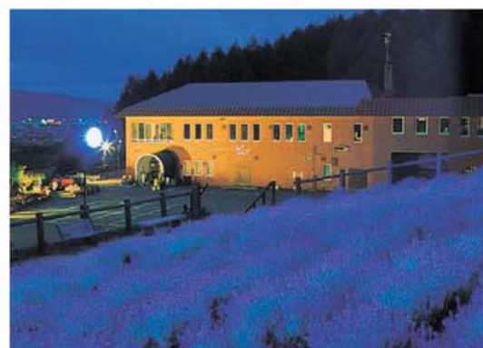
Central Hokkaido Gateway City

Minamifurano is surrounded by mountains and retains a tranquil atmosphere. The Beautiful Lake Kanayama is an ideal place for camping and fishing.