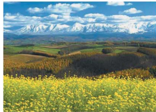
Picturesque Town of Rolling Hills