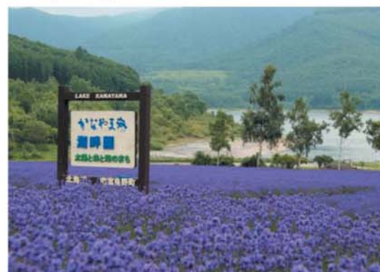
Town of Forests and Lakes

Nakafurano boasts beautifully coloured flowers amongst its natural beauty. Visit the world famous Farm Tomita to see the sea of lavender and rainbow coloured flower fields. An old-fashioned single chair lift takes visitors up to the top of Choei Lavender Garden for an excellent view.