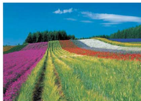
Town of Abundant Natural Assets next to Mt. Tokachidake

The Tokachidake Onsen Hot Spring Village is the highest point reachable by car in Hokkaido. 100% volcanic hot spring water soothes the body and soul. There are art galleries and spots of interest in the Miyama Pass along the scenic Route 237.