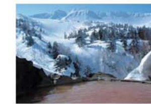
Ryounkaku Hot Spring Villa. Scenic Open Air spa Hokkaido's highest driving point of 1,280m.

Located halfway up Mt. Tokachidake of the Daisetsuzan National Park, in the middle of virgin forests. The area is a popular destination in fall due to its beautiful fall foliage, but it also offers excellent hiking in summer, and the best