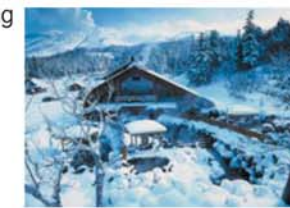
Hakuginso Hot Spring Backpackers