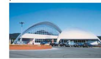
Kanayama shore campground

Make a stop at the roadside station souvenir shop to pick up some locally produced souvenirs or tourist information. There is also a diner where one can grab a light meal or pick up fresh produce at the summer farmers market.