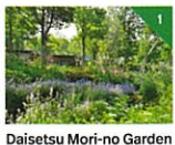
Daisetsu Mori-no Garden