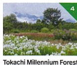
Tokachi Millennium Forest